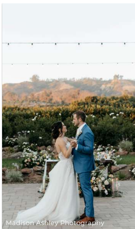
Madison Ashley Photography