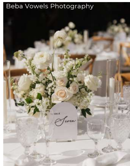
Beba Vowels Photography