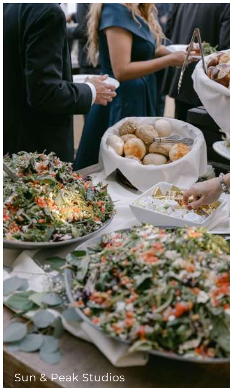
Sun & Peak Studios