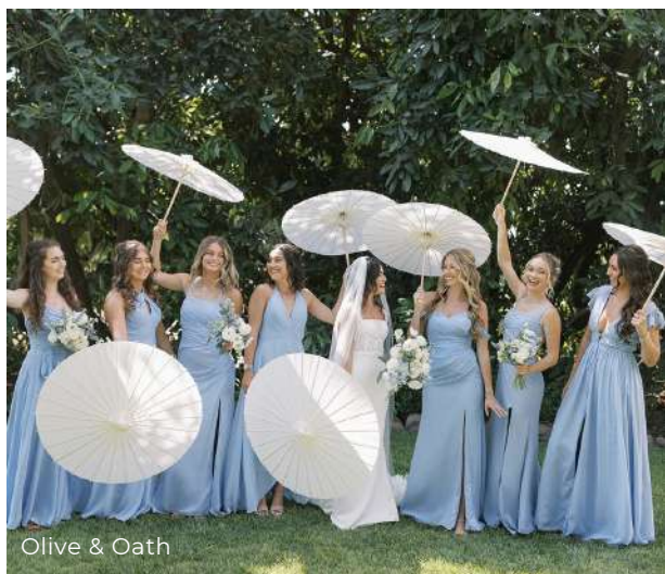
Olive & Oath