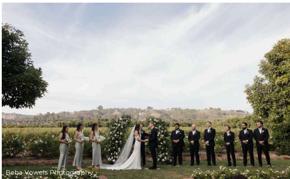
Beba Vowels Photography